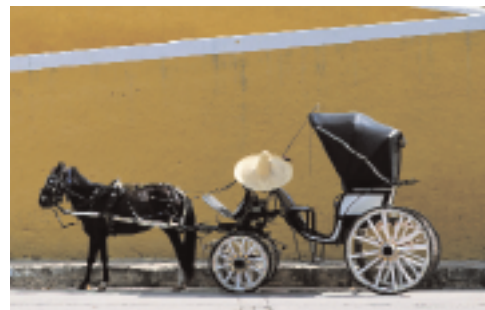
A horse and carriage await its driver in a sunny spot in Izamal.

After breakfast, transfer to the airport for your flight home. (B)